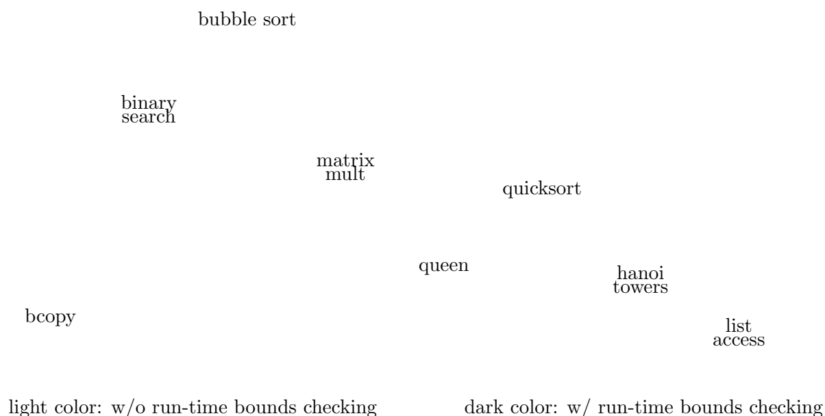
Figure 9.3: Dec Alpha 3000/600 using SML of NJ working version 109.32

for maintaining a software system since they provide the user with informative documentation. We feel that these factors yield a strong justification for our approach.